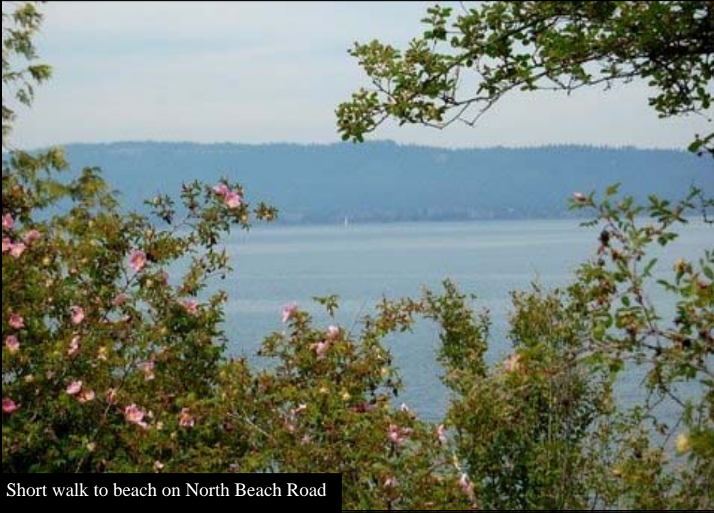
Short walk to beach on North Beach Road