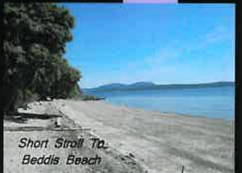
Short Stroll To Beddis Beach